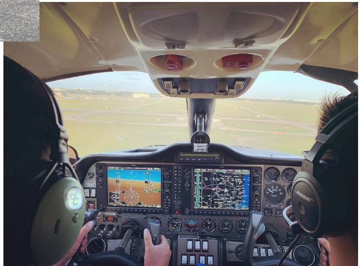
Figure 2. Interior of TAA P2006T