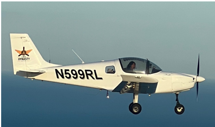
Figure 1. Sling LSA

The modern training aircraft we utilize is the brand new Sling LSA (Figure 1.), which is a Two-Seating, 100 Horse Power light sport aircraft capable of cruising at 120 nautical miles per hour. The fully digitalized cockpit display with touchscreen function, the digital engine control FADEC unit and the two-axis autopilot automation system allow our students to train in a modern and enhanced safety environment. The FAA qualifies the Sling LSA as a “ Technically Advanced Aircraft ” (Figure 2) which allows our students to train from zero to commercial pilot in the same type of aircraft without switching to meet the complex aircraft requirements. Remember, you will be flying a brand new aircraft without the increased cost compared to other conventional flight schools.