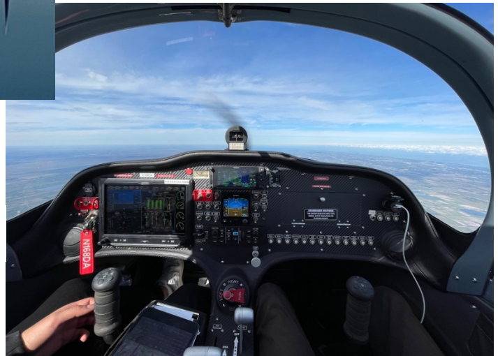
Figure 2. Interior of TAA Sling LSA