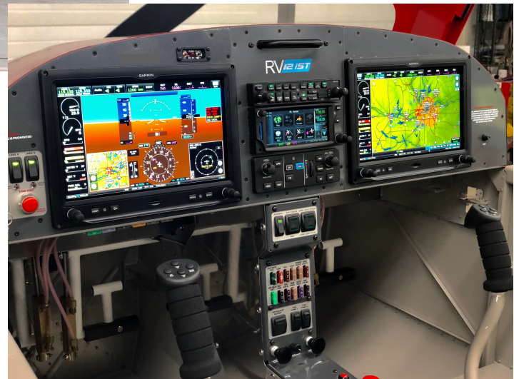
Figure 2. Interior of RV-12