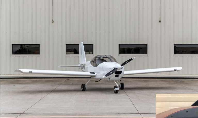
Figure 1. RV-12

RV-12is is a light sport aircraft (LSA) for flexible pilot certification options! Equipped with 100 Horse Power Rotax 912iS engine and modern avionics, the RV-12iS also has a spacious two-seat cockpit and well-known for its excellent performance to go as fast as 120kts . It's an aircraft built for a professional and enjoyable flight training experience. The onboard two-axis autopilot and dual touch-screen Garmin G3X provides enhanced safety and professionalism during flight operation and allows our students at Dynasty Aviation for a smooth transition to the modern airline cockpit environment. The most importantly, we are one of the very few flight schools to offer flight training in brand new modern aircrafts with an affordable price!