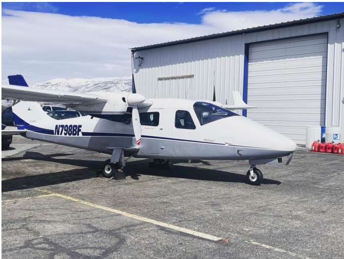
Figure 1. Tecnam P2006T

The Tecnam P2006T is a high-wing, twin-engine (Rotax 912ULS), retractable tricycle landing gear aircraft equipped with four-seat . This multi-engine aircraft stands out as the most popular choice for flight training due to its light weight, stability and its modern cockpit design. Our 2014 P2006T is equipped with dual G950 screens and two-axis autopilot system . It's also authorized as a Technically Advanced Aircraft equipment, which would be a more efficient option for students to connect from training to real airline career.